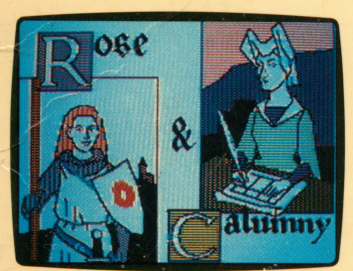
Rose & Calumny